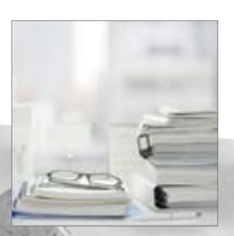
Registration of any funds data changes