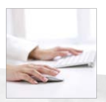
Accounting services and funds' assets appraisal