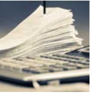
Support for issuing investment certificates, including legal documentation required by law